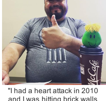
"I had a heart attack in 2010 and I was hitting brick walls trying to find work. My confidence was so low. What we learned here is that there are a lot of ducks out there, but we are eagles."