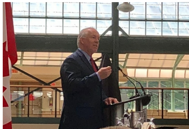
Attended a multi-Chamber of Commerce event in Victoria with guest speaker Premier John Horgan on May 15, 2018.

Determining business needs at a provincial level and working with government, both provincially and federally, to find support for employers has been a focus this month. As the unemployment rate decreases, employers are identifying post employment training supports are needed; especially those to do with softskills training. Government seems poised to design robust program opportunities that our members can use their expertise to deliver within their communities. In addition to meeting with provincial advocacy groups, this month I have been also been networking with Victoria businesses to collect their feedback. Earlier this month I attended a multi-Chamber of